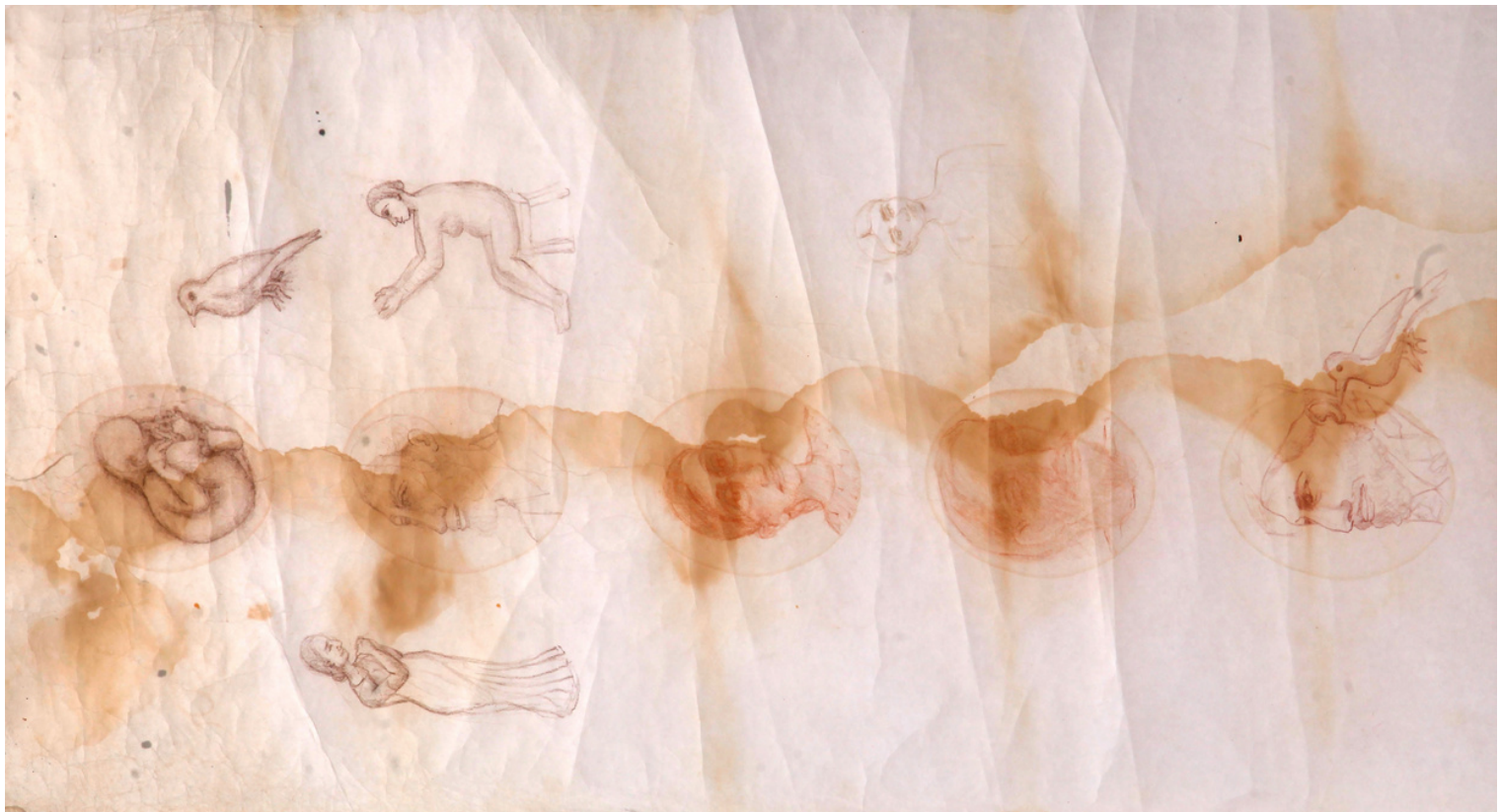
Lalitha Lajmi - Memory Roll 1 - Recent Drawing - Watercolour and Pencil, Crayon Drawing on Japanese Paper Scroll. 1.2 Feet x 21 Feet

Stay tuned for the link on our website and social media channels!