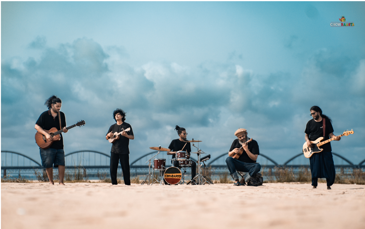
Chowraasta Band in the image above.